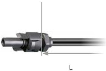
Female panel receptacle