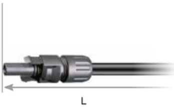
Female cable coupler